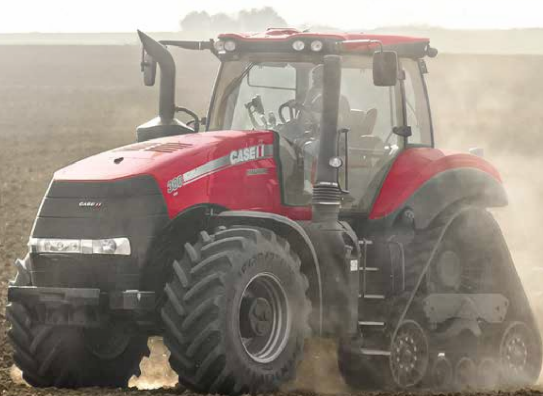
The flagship of the Magnum range, the Magnum Rowtrac 380 CVT

Case IH will offer a redesigned front tyre exclusive to the Magnum Rowtrac. The