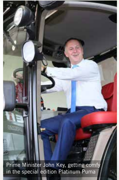
Prime Minister John Key, getting comfy in the special edition Platinum Puma

The creation of their new flagship premises in Cambridge is a bold move by Giltrap AgriZone, but they are confident it was the right choice and the next logical step in the future growth of the company. It not only was an opportunity to improve the service offered to their customers but it can be seen throughout that every aspect of the building and its functionality have been well thought out to ensure that it meets the requirements of the company at present and also has sufficient scope for future growth. It is a consolidation of growth that has been achieved in recent years and has definitely cemented their position as a leading agricultural machinery supplier in the area.