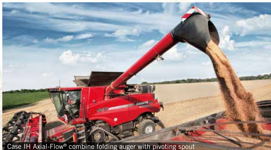
Case IH Axial-Flow® combine folding auger with pivoting spout

"Case IH has been continuously improving the Axial-Flow AFX rotor, always setting the trend as a leader in harvesting," says Tim. "Overall, the simple and reliable Axial-Flow design, with fewer moving parts, helps producers stay in the field over a wider range of crop conditions, helping protect both yields and quality."