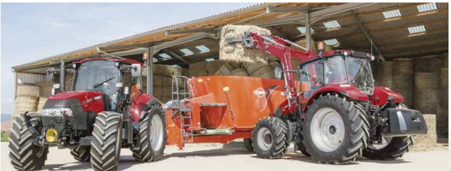
The new 2015 Farmall range continues the legacy that started over 90 years ago

PTO as well as specialist municipal hitches available to fit any need. Available in 105 and 115 horsepower, the Farmall U Pro defines the Farmall name - whether dairy, drystock, cropping or contracting the U Pro fills a gap in the market for a compact, highly specified premium utility tractor.