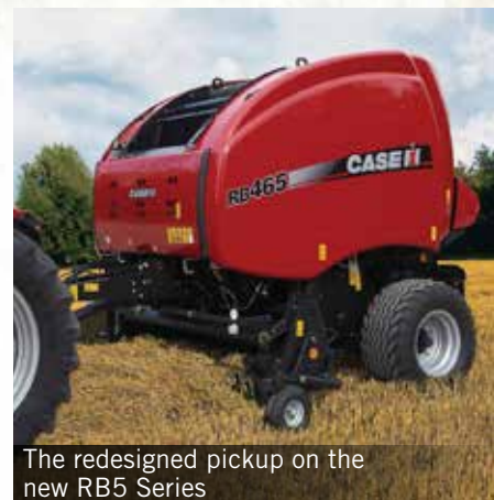
The redesigned pickup on the new RB5 Series

Case IH is offering an optional AFS Pro 300 touch-screen colour monitor which incorporates improved graphics, easier navigation and the ability to control functions and settings from the main screen. Customers can, however, use the new ISOBUS-compatible RB455 and RB465 balers with an existing virtual terminal on any ISOBUS-equipped tractor.