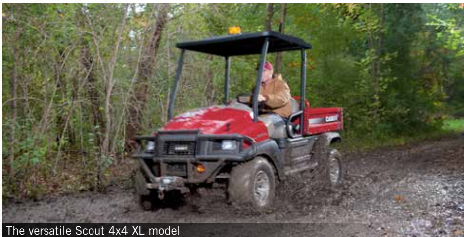
The versatile Scout 4x4 XL model