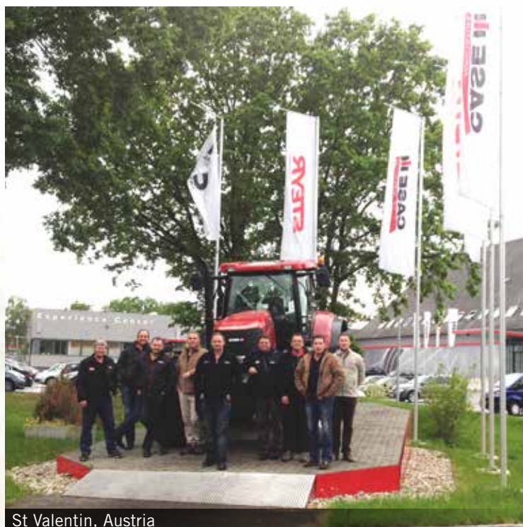
St Valentin, Austria

Richard Clapperton from Agricentre South reckoned the trip was a lot of fun but more importantly a valuable opportunity to get up to speed on the latest products coming to market. "the practical and classroom sessions we received from the professional product trainers means we come back home with a huge amount of knowledge on what makes Case IH machines the best on the market".