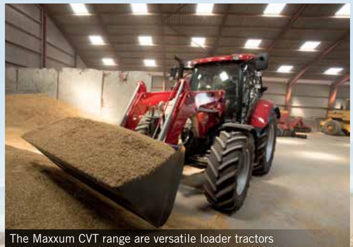
The Maxxum CVT range are versatile loader tractors