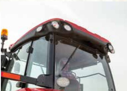
The latest cab

Case IH recognises that precision farming is a very important consideration for a tractor of this size, and this aspect has not been