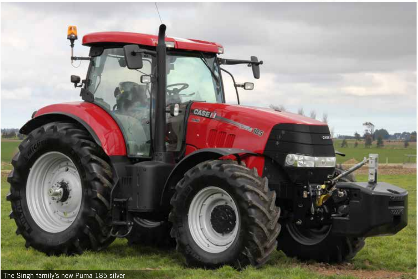
The Singh family's new Puma 185 silver

to work the ripper. They have just received their new Case IH Puma 185 silver to handle this job. The Puma will tow the ripper and be fitted with front PTO and linkage to operate double mowers. The Puma has a common rail engine with low emissions and great fuel efficiency, and an 18x6 powershift transmission.