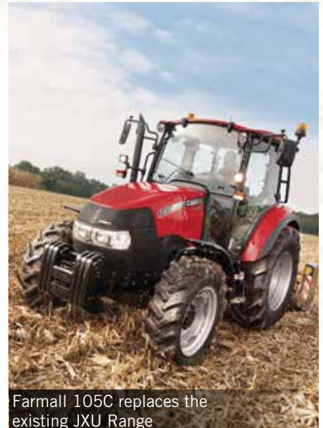
Farmall 105C replaces the existing JXU Range

There are options of factory loader ready, integrated front hitch and