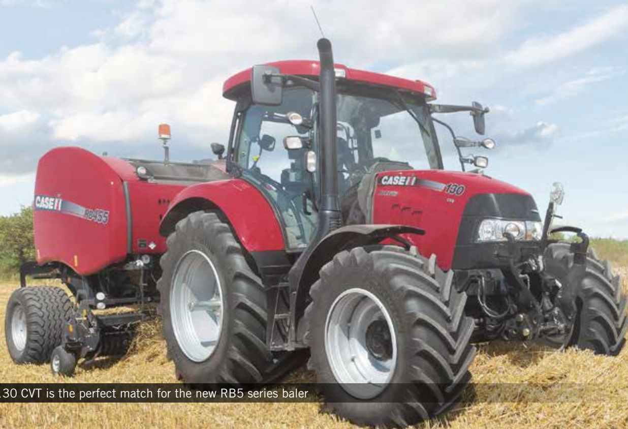
The new Maxxum 130 CVT is the perfect match for the new RB5 series baler

CVT also offers an active stop feature that is especially popular in New Zealand's hilly terrain, according to Tim. "You simply pull the Multicontroller all the way back, and it will stop the tractor and its load without having to push