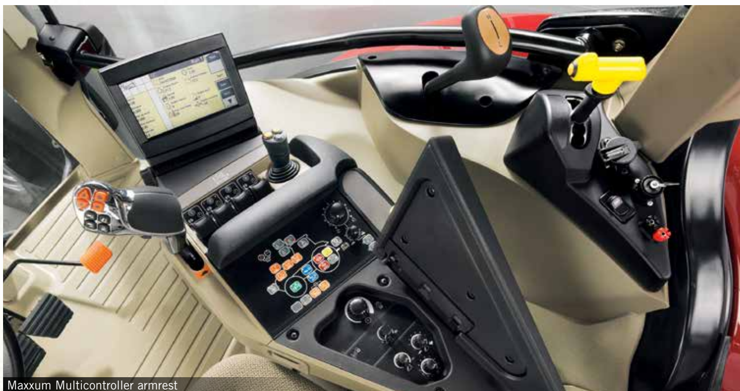
Maxxum Multicontroller armrest

Giltrap AgriZone, as with all Case IH dealers throughout New Zealand, have the full backup of a genuine Case IH parts warehouse and technical service right here in New Zealand. “Giltrap Agrizone have a really good reputation in Cambridge and I knew they would provide a great service”.