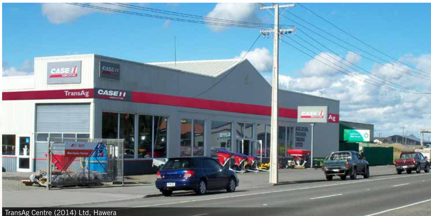
TransAg Centre (2014) Ltd, Hawera

C B Norwood Distributors Ltd is the wholesaler for Case IH, and Merv says they have the best parts system in the country. "The big attraction for Case IH is that 90 percent of the parts are held in Palmerston North. C B Norwood have more than $20 million worth of parts in the country and all the back-up expertise."