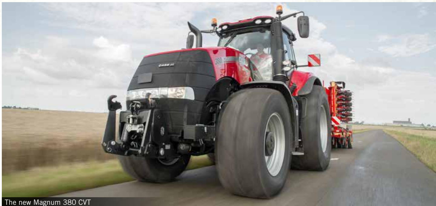
The new Magnum 380 CVT

More than 150,000 Magnum tractors have rolled off the production line since its introduction way back in 1987. To commemorate this incredible milestone, Case IH will launch a revised new model line-up in 2015, featuring both powershift and CVT versions up to 380 rated (435 boosted) engine horsepower. Here's an overview of some of the changes: