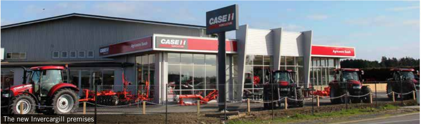
The new Invercargill premises

The Case IH and Kuhn brands are now represented by Southland's newest dealership, which has set out to raise the bar on service and convenience. Previously Advance Agricentre Ltd, the business re-branded to Agricentre South Ltd and moved into new purpose-built premises at the Lorneville Roundabout in Invercargill.