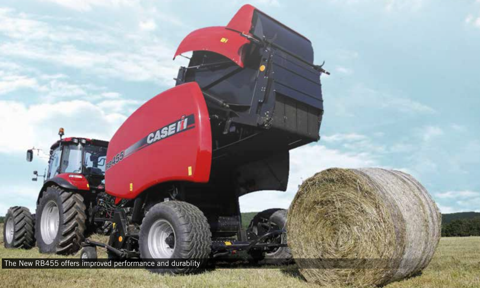
The New RB455 offers improved performance and durability

Optional on 1.8m and 2.0m pickups, the new five-bar reel provides significant advantages over a standard four-bar design. Featuring larger, stronger components for increased