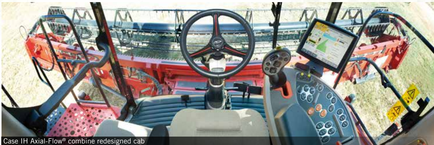
Case IH Axial-Flow® combine redesigned cab

Case IH has unveiled new features on its legendary Axial-Flow® combines for 2014, including a redesigned cab and a folding auger with an industry-exclusive pivoting spout option, helping to make these high-output machines even more productive.