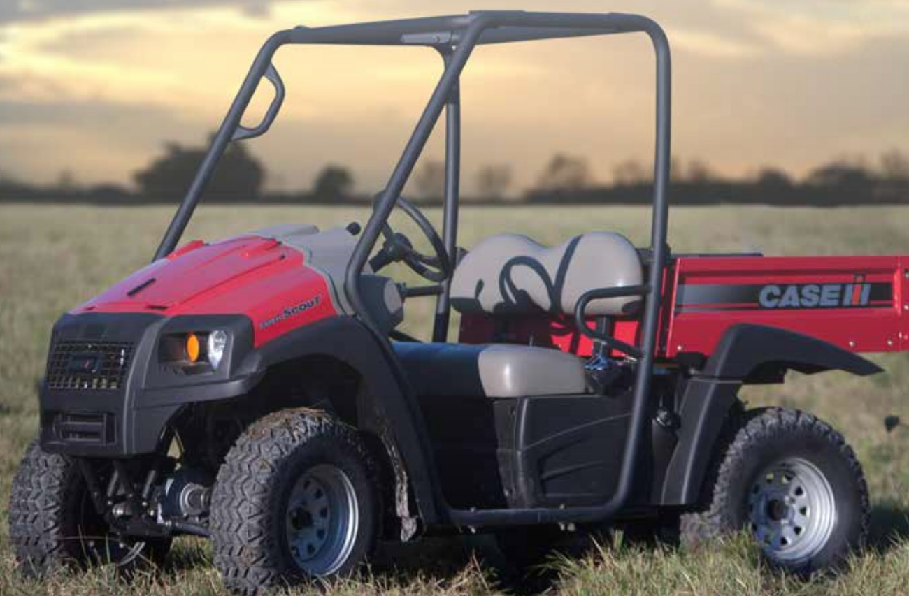
The new Scout 4x4 Basic model

All three models feature mud tyres and a comfy, soft cushioned bench seat - easily accommodating two