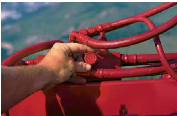
A convenient flow control valve lets you adjust reel speed to match crop conditions and ground speed.

transport position is easy, too. Use the hydraulics to shift the baskets to their transport position, and the swing frame folds as you move the tractor forward. You just raise the baskets and go. There's no need to leave your tractor seat. And, when you get to the next field, your previous basket angle and width settings are repeated automatically! The 216 saves you time and hassle.