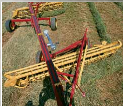
Use the Model 252 to rake two swaths into two separate windrows.