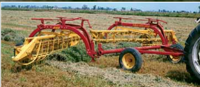
V-tandem rake hitch