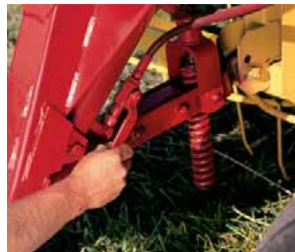
Shutoff valves on each basket lift cylinder provide the option of locking both baskets in the "up" position for transport and easy hookup. One basket may be locked up when raking a single windrow.