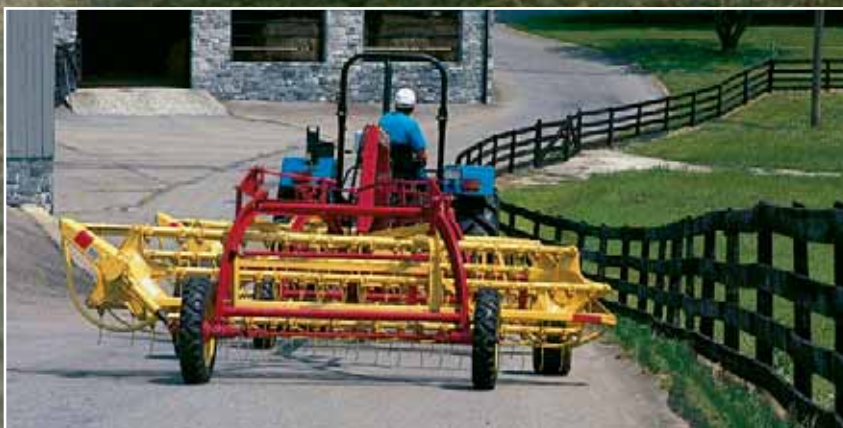
The Model 252 rake hitch has a narrow 8'11" transport width.