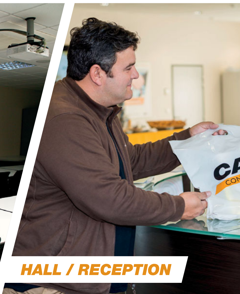
HALL / RECEPTION