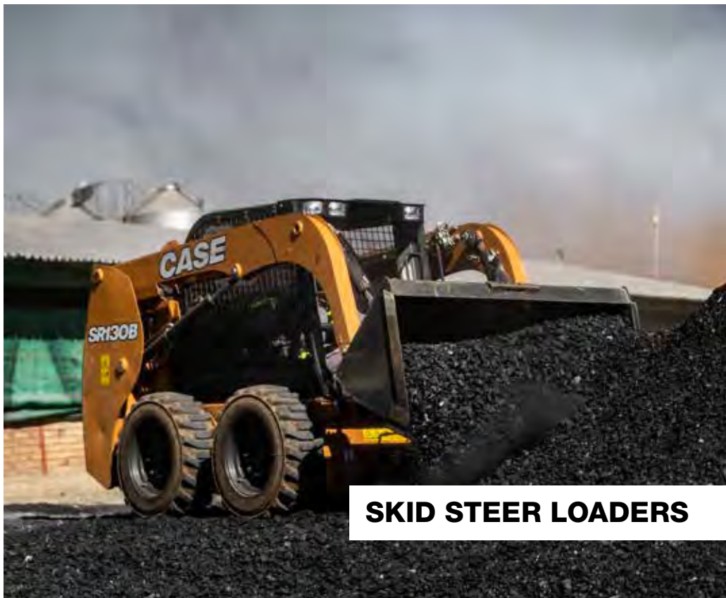
SKID STEER LOADERS