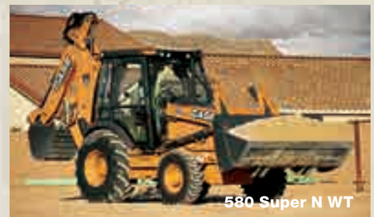
580 Super N WT