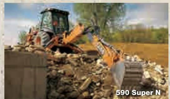
590 Super N