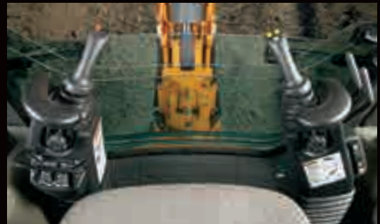
Pilot control towers offer industry-leading ergonomic design.

Exclusive creature comforts such as infinitely adjustable pilot control towers that adjust fore/aft and tilt in/out, as well as comfortable armrests, adjustable wrist rests and a footrest help keep any-sized operator comfortable.