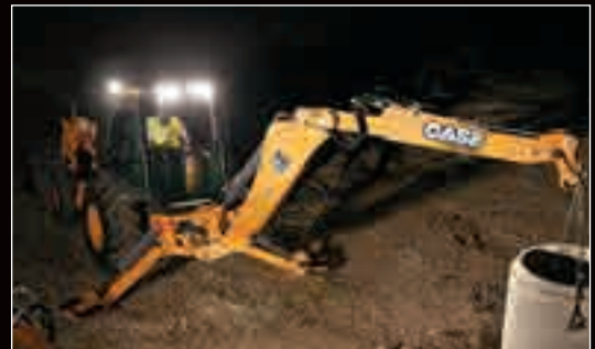
Adjustable “Easy Flex” side lights come standard.

Operators can customize the feel of forward-to-reverse transitions, thanks to our industry-exclusive SmartClutch modulation. Aggressive or soft, set it to what you need.