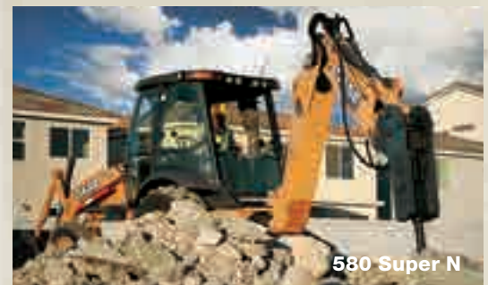
580 Super N