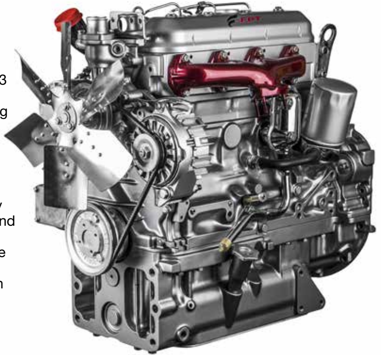
FPT S8000: proven technology!

Coupled with the turbo pre-cleaner, the water cooled engine ensures excellent cooling and lowest fuel consumption in its category.