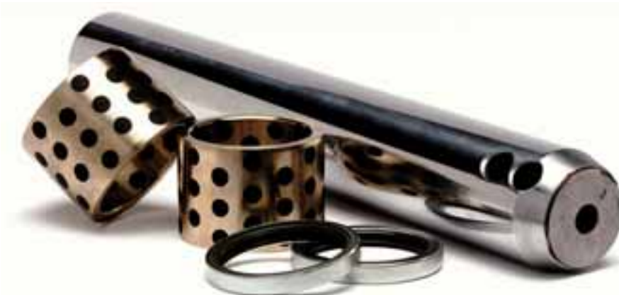
EMS chrome plated pins with brass bushing

Previously only available on machines above the CX330, Extended Maintenance Bushings (EMS) are now standard equipment on all Case CXB series excavators. These low maintenance bushings provide up to 1,000 hour greasing intervals, greatly reducing daily and weekly maintenance for the operator, and increasing productivity. Anti-friction resin shims in the boom foot and head reduce noise and free play, increasing durability and reliability for the customer.