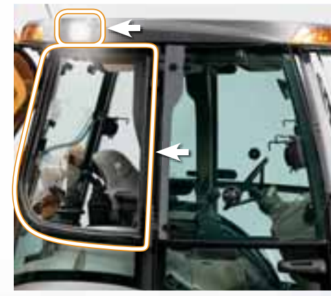
New rear-quarter windows and side lighting

When your operation runs day and night, our new cab keeps your operators productive. Floor-to-ceiling windows provide superior visibility. New rear-quarter windows provide easy communication to the back of the machine and improve cross-ventilation comfort. The high-intensity lighting package improves performance by 28 percent,