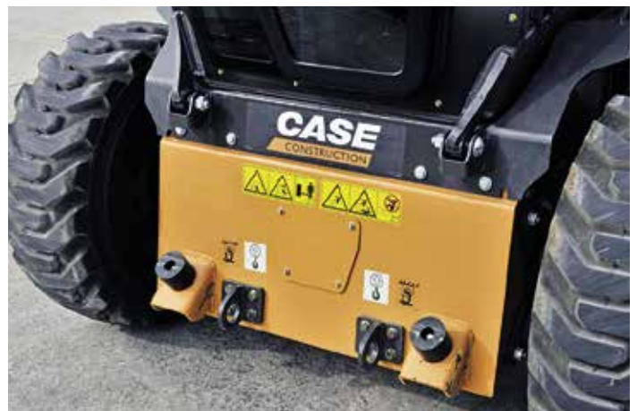
Chassis supports pushing power!