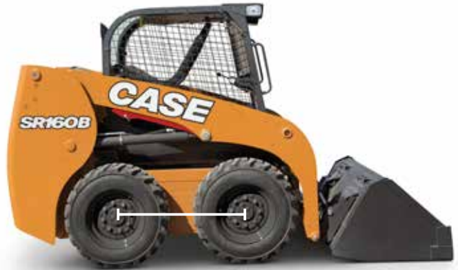
Great stability thanks to the long wheelbase

Simply bolt on additional counterweights to the rear sides of the machine. Increase ROC by adding counterweights to move more material, more quickly Decrease ROC (operating without counterweights to keep fuel costs down and decrease ground disturbance.