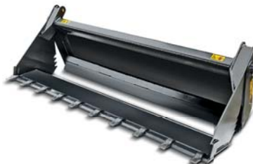
4X1 MULTIPURPOSE BUCKET