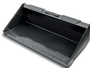
WIDE RANGE OF BUCKETS