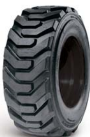
PREMIUM & PREMIUM W/LINER