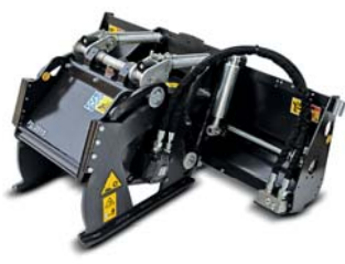
PLANER (350 mm)

Hydraulic Coupler Option: An optional hydraulic attachment coupler increases both operator comfort and uptime on the job site since attachments can be exchanged quickly and safely without leaving the cab.