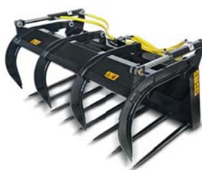
FORK & GRAPPLE