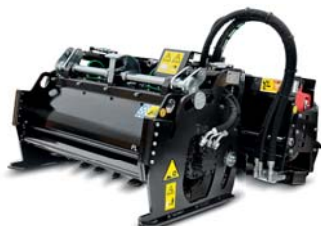
PLANER (1000 mm)