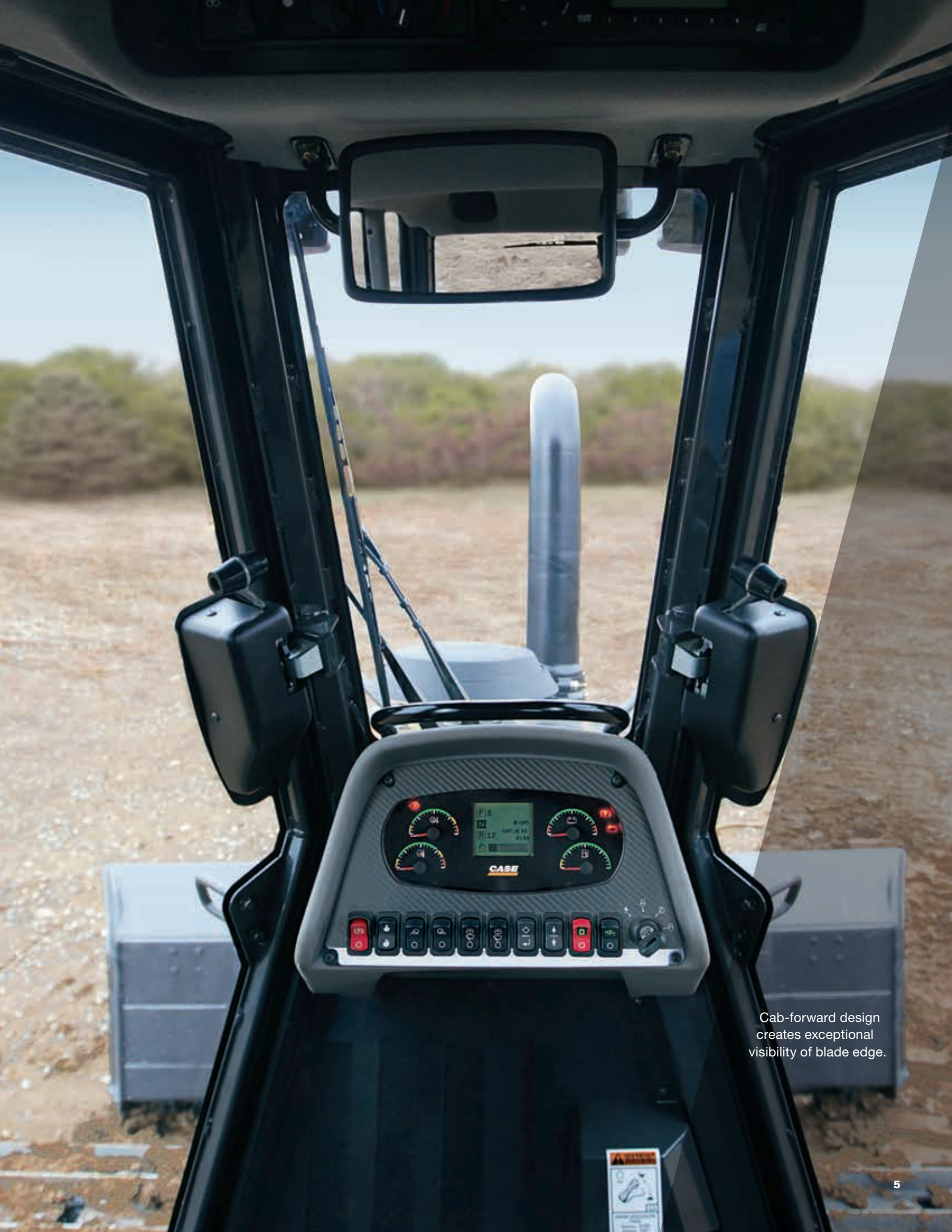
Cab-forward design creates exceptional visibility of blade edge.