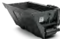
Side Discharge Bucket