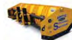
Arctic® Sectional Sno-Pusher™