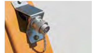
Front Electric/ Multi-Function (excl. SR160B)