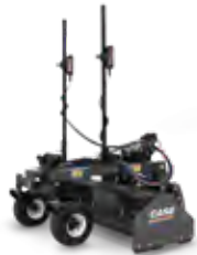
Laser Grading Box

All models come standard with a universal coupler that will work with numerous attachment manufacturers, meaning you can do more with a single machine to give your business even greater versatility. Consult your dealer for details.