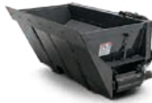
Side Discharge Bucket