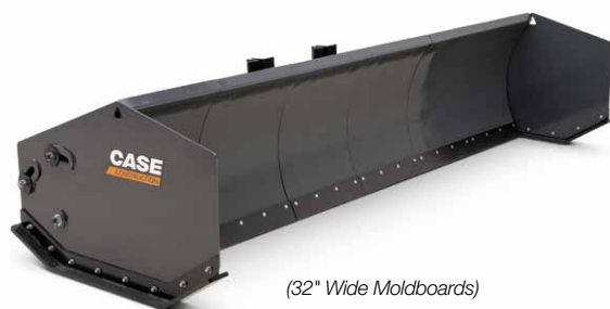
(32" Wide Moldboards)