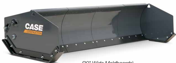
(30" Wide Moldboards)

† Base unit does not include mounting kit; dealer must order mounting kit for "HD" pushers: JRB416 for 521F – 721F, JRB418 for 821F and 921F, or Bucket Mounting Kit.