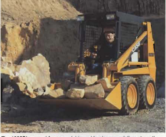
The 1825B's rugged frame, uprights and loader arms deliver strength and durability in almost any application.

The 1825B is perfect for many applications. Even in the most confined spaces, the powerful 1825B tackles the toughest jobs. Compact size, precise controls, and superior visibility make maneuvering in tight areas safe and efficient.