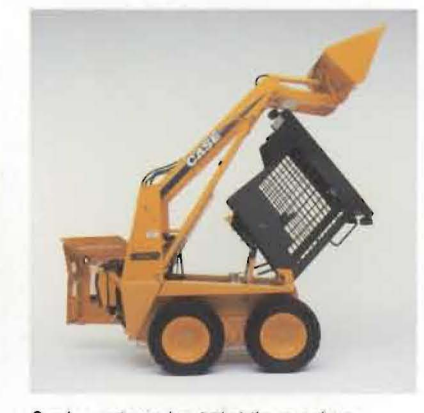
Service ports are located at the rear door, uprights, and under the front floor plate and lift arms, for easy service with no crowding.