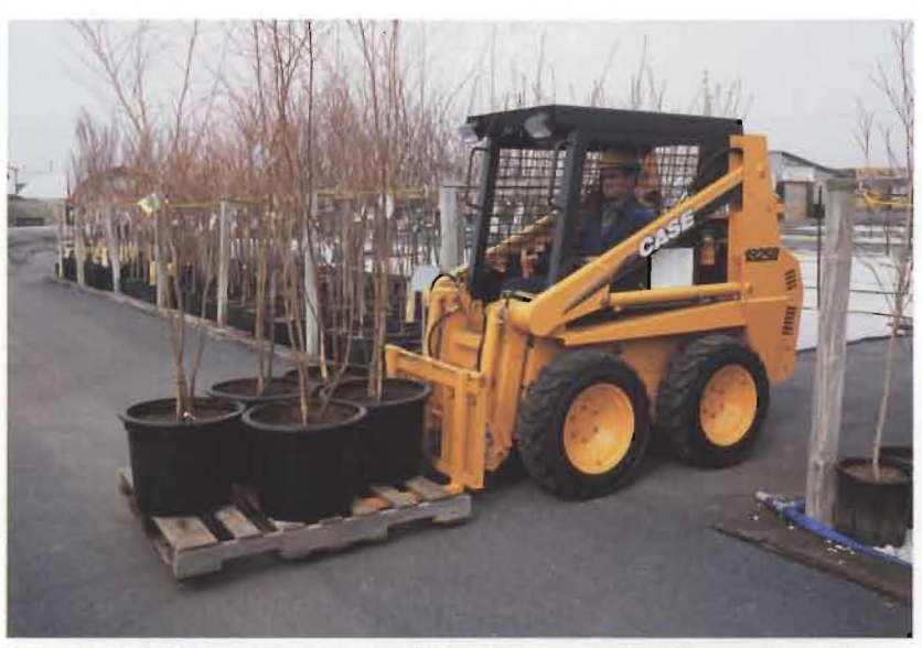
Compact size, precise controls and superior visibility make maneuvering in tight areas safe and efficient. The superior power-to-footprint ratio makes the 1825B ideal for heavy-duty work within confined spaces.