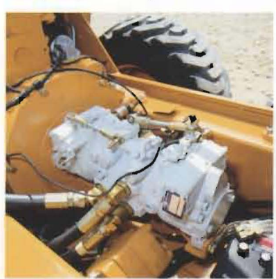
Open access to major components makes service easy.