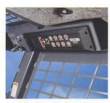
An overhead digital monitor displays vital machine functions, including an hourmeter, fuel level, systems normal light and seat belt reminder.