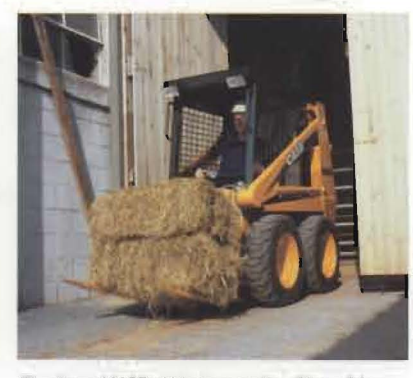
The Case 1825B skid steer works with a wide variety of attachments, letting you work harder, and maximizing production for your investment.