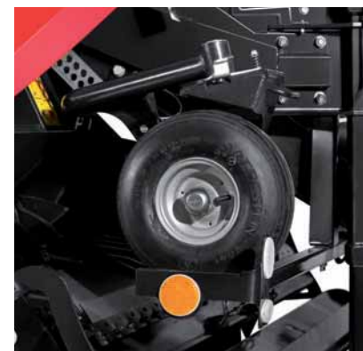
Pick-up wheel transport position

3 Pick-up is equipped with a windguard on all versions