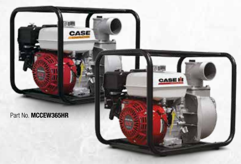
Part No. MCW365HR