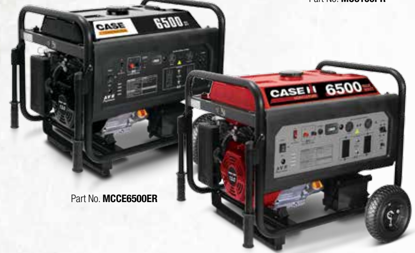
Part No. MC6500ER