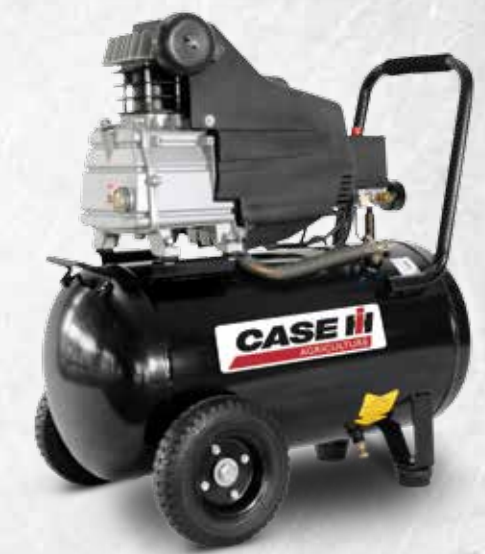
Part No. MCAC3012