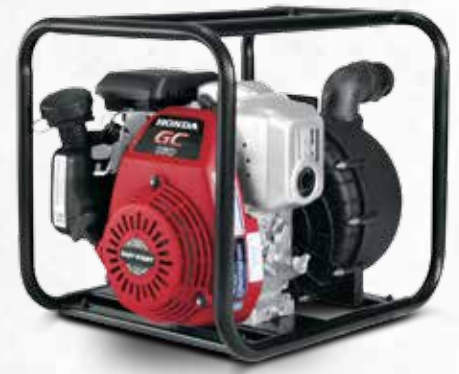
Part No. MCW25HN