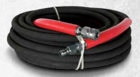
Part No. MCNH238250