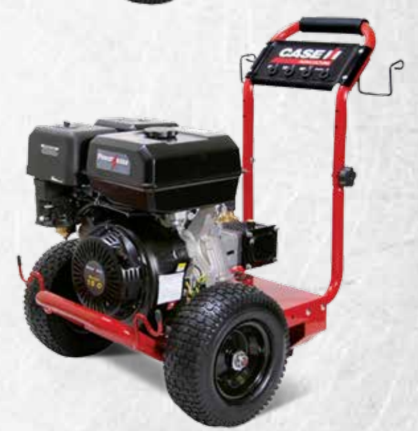
Part No. MC4015RA