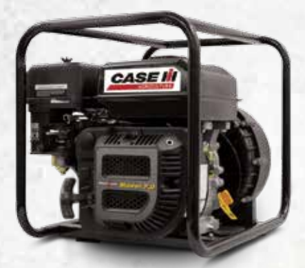
Part No. MCW27RN