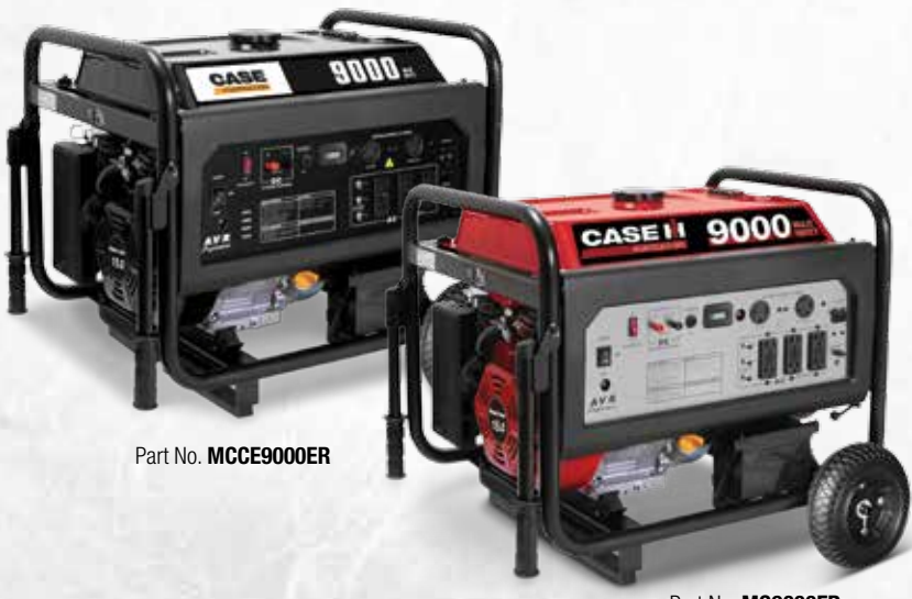
Part No. MC9000ER