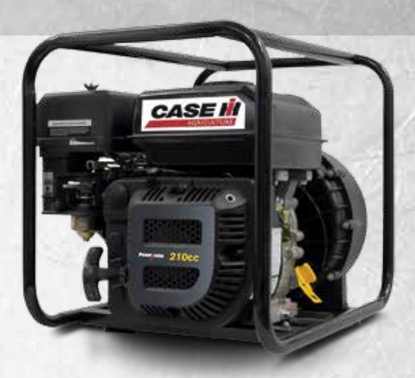
Part No. MCW37RN