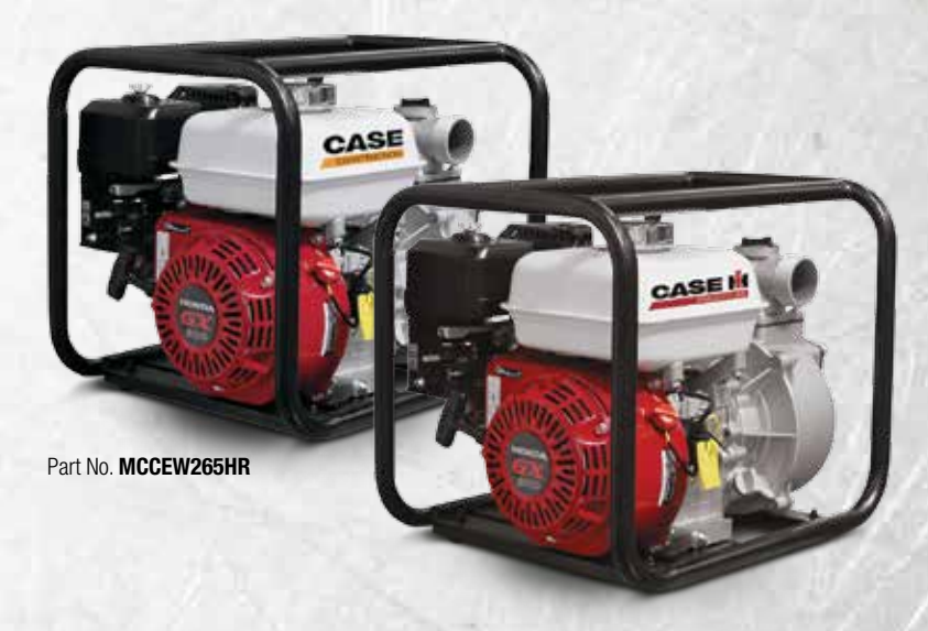
Part No. MCW265HR