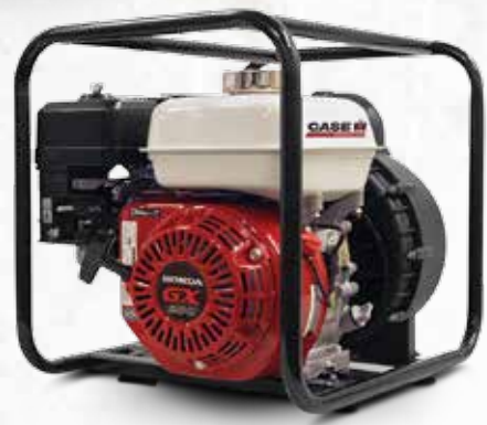
Part No. MCW265HN