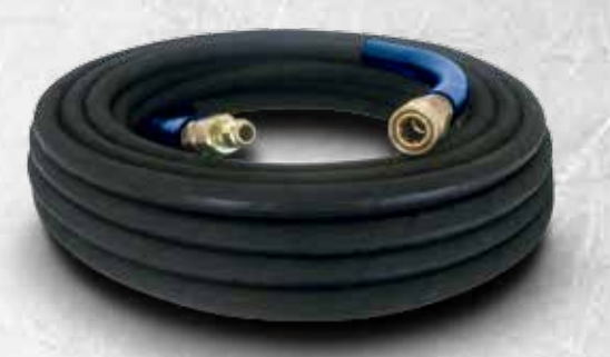
Part No. MCNH238151