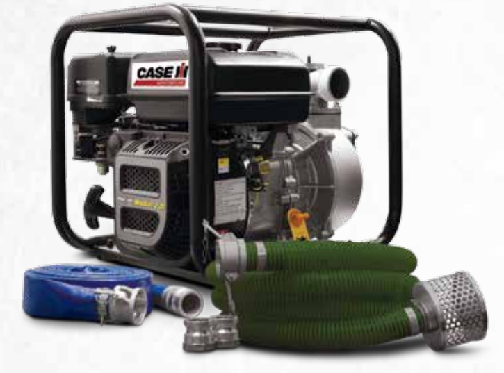
Part No. MCW27RKIT