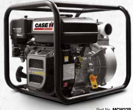
Part No. MCW27R