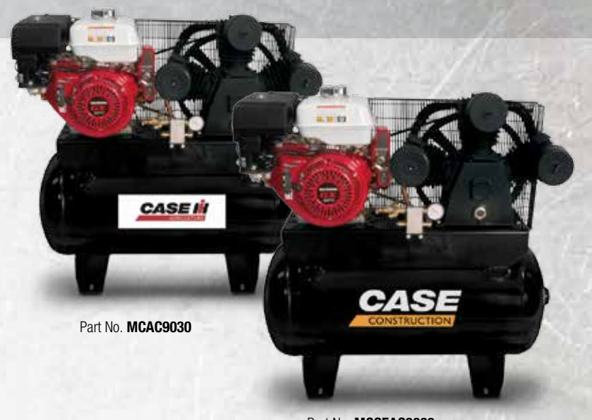
Part No. MCCEAC9030