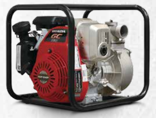
Part No. MCW25HR