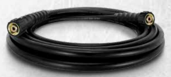
Part No. MCNH225229N