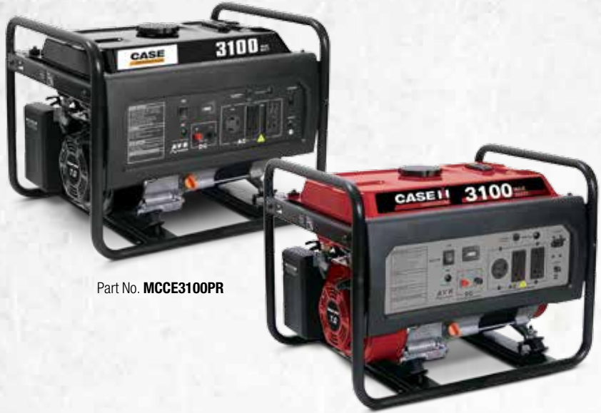
Part No. MC3100PR