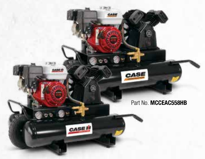
Part No. MCAC558HB