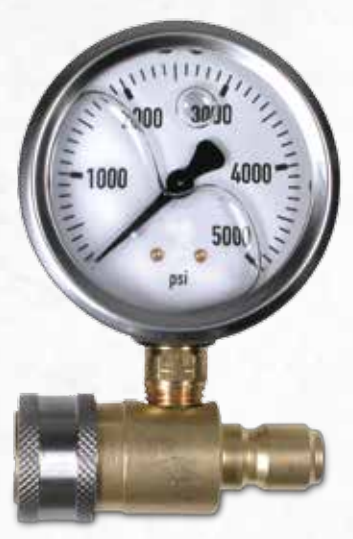
Part No. MCNH305001