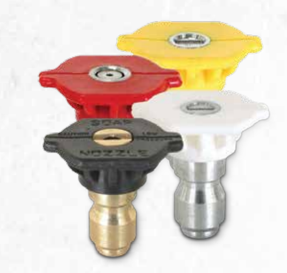
Part No. MCNH210030 & MCNH210035