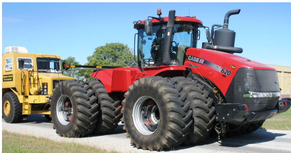
CASE IH STEIGER 620 Diesel

Institute of Agriculture and Natural Resources University of Nebraska-Lincoln