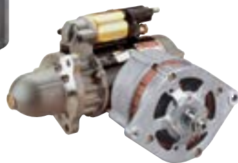
STARTERS AND ALTERNATORS

Case IH remanufactured parts are completely disassembled. All parts are thoroughly inspected and reassembled to the latest OEM specifications.