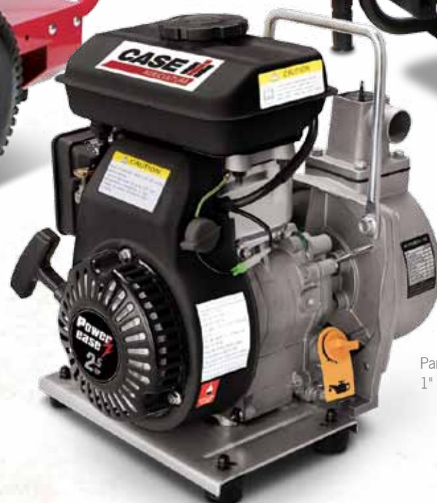
Part No. MCW125R 1" WATER PUMP