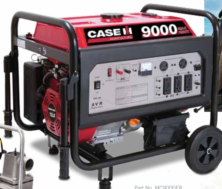
Part No. MC9000ER 9000-WATT, GAS GENERATOR