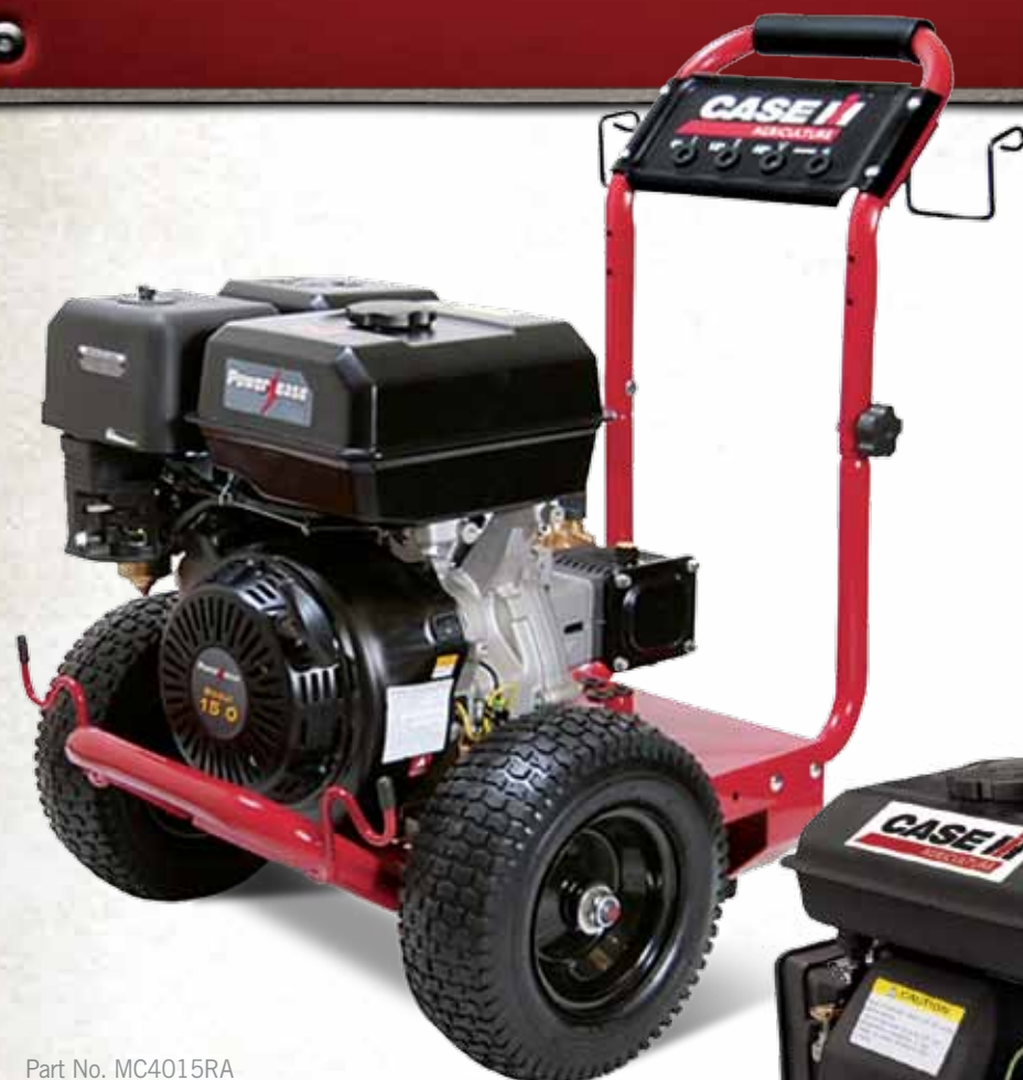
Part No. MC4015RA 4000 PSI, GAS PRESSURE WASHER