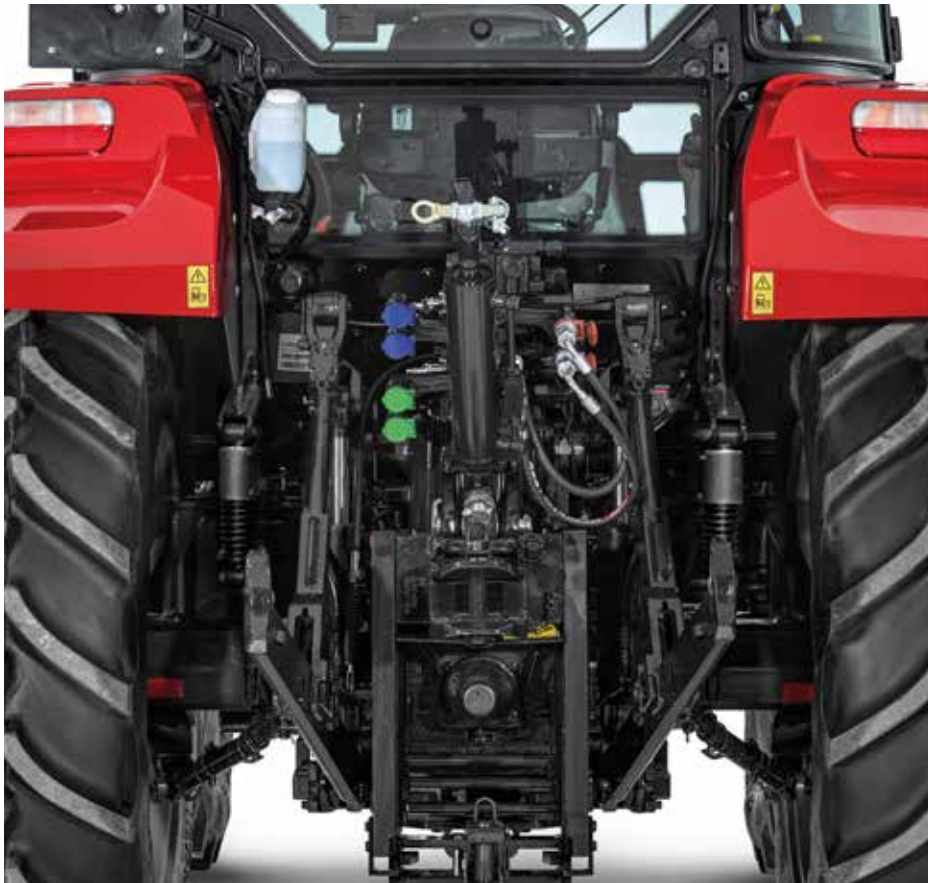
Mechanical suspended cab

With the combination of suspended cab and air suspended operator seat, jolting during heavy working conditions is minimized by adjusting the suspension to suit your personal preference.