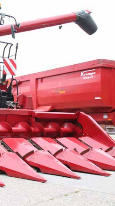
Rainer Uckelmann (top left) has now set himself in business independently with the service of corn stubble harvesting. The combine harvester is equipped with a front-mounted corn picker attachment arranged behind the folded up stubble bunker.