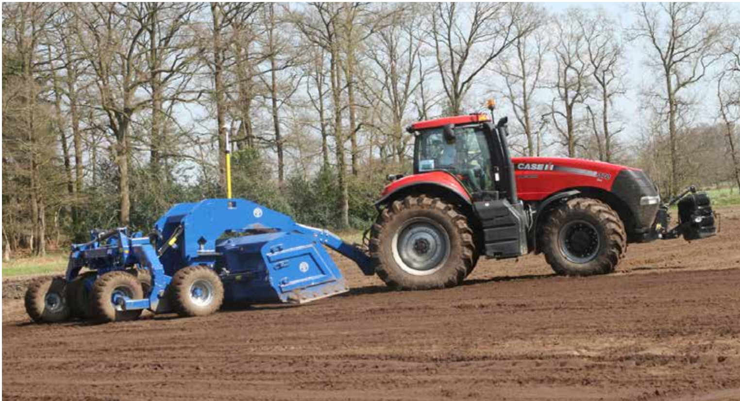
Practical experience using the new water management system show that yield improvements of up to 20% on recently levelled fields are possible despite retaining the previous water problem.

precision is achieved through the use of the Case IH RTK+ network on which real-time kinematic correction data can be transmitted by mobile radio / i.e. wireless devices.