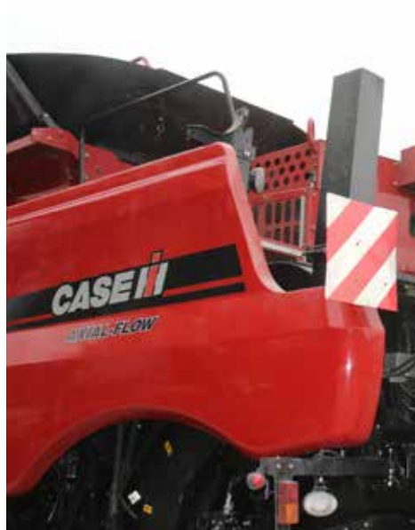
Through the additional channel installed (black box in this photo), stubble is conveyed upwards and into the bunker. When lowered, the bunker locates over the shaft.