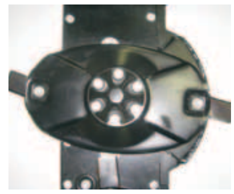
The enclosed gear-driven cutterbar uses two high-quality steel knives on each lowprofile, oval disc to produce a fast, clean cut. The discs are retained with six bolts for easier service.