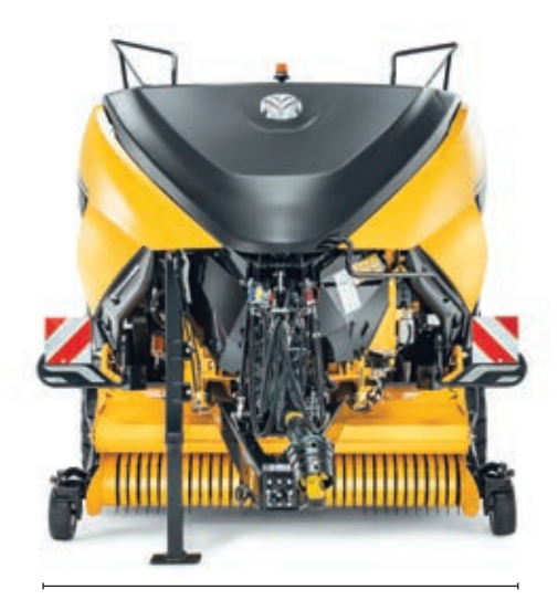
min. width 2987mm

The overall road width with this tyre stays within 3m.