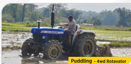
Puddling - 4wd Rotavator