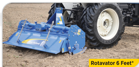
Rotavator 6 Feet*