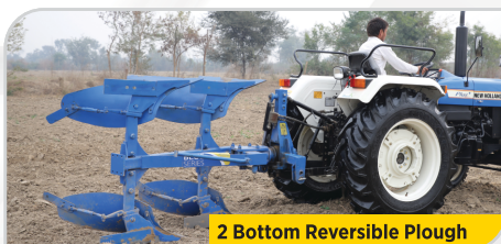
2 Bottom Reversible Plough