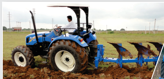
REVERSIBLE MB PLOUGH