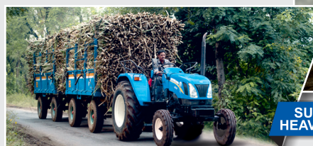
SUGARCANE HEAVY HAULAGE