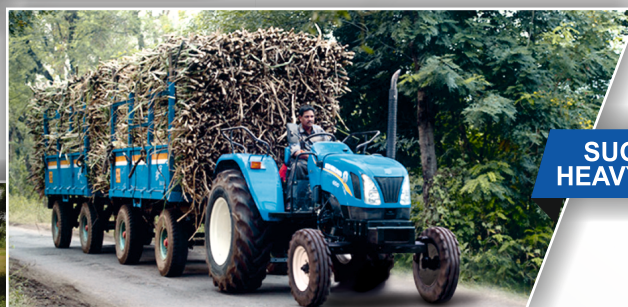
SUGARCANE HEAVY HAULAGE