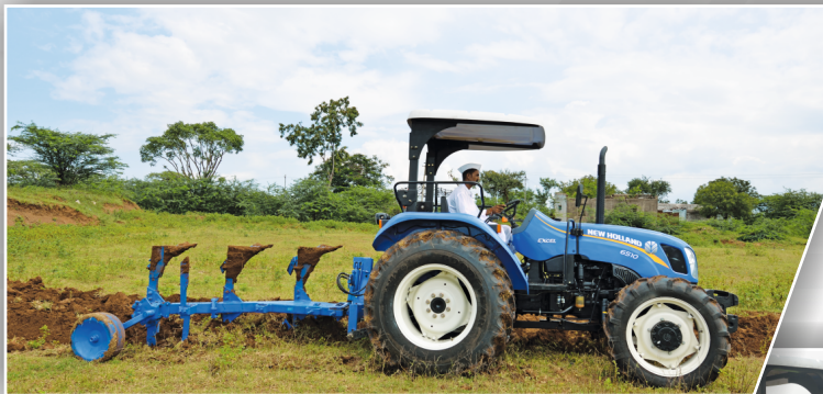
REVERSIBLE MB PLOUGH