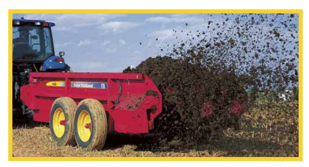
New Holland box spreaders are designed to produce an even spread pattern and are built for years of dependable service.