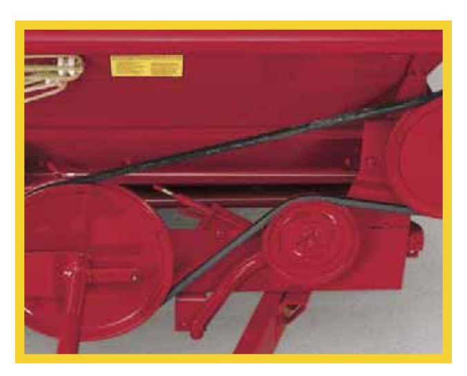
All models have a reliable straight-line V-belt drive that runs quietly and smoothly, eliminating the need for a slip clutch.