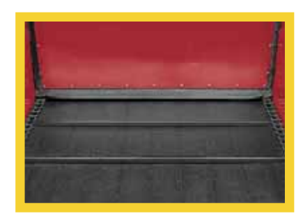
Floors are made of ¾"x 6" high-density polyethylene (HDPE) tongue-and-groove planks for a tight, leak-free fit.