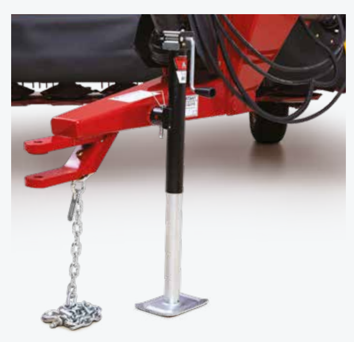
Discbine 210 standard tongue

Simple headland turns and well-shaped, clean-cut corners are standard with every New Holland Discbine model. Productivity means saving time at every step and the curved tongue of the Discbine 210 offers exceptional tire clearance through the tightest headland turns for expertly mown corners. The constant velocity driveline provides chatter-free turns and the curved tongue design maintains the driveline angle as straight as possible while mowing, reducing driveline wear and tear.