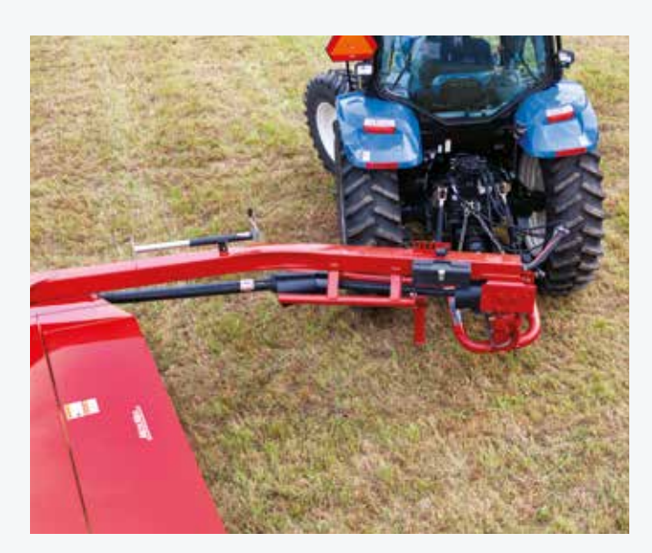
Discbine 210 optional 2-point swivel hitch

Every farm has those small fields, triangles or areas that are just plain odd. Every acre counts so take the stress out of difficult turns with the optional swivel hitch for Discbine 210 models. Compared to traditional hitches that pivot on the drawbar, the pivoting action of a swivel hitch is moved rearward, behind the PTO at the swivel gearbox. No matter how sharp the turn, the PTO will remain straight which virtually eliminates PTO wear, and there is never risk of a collision between the PTO and tractor lift arm. This high-reliability swivel hitch option is available with your choice of drawbar or two-point attachment.