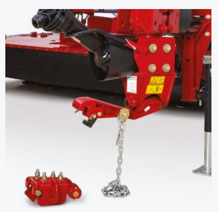
Discbine 210 optional drawbar swivel hitch