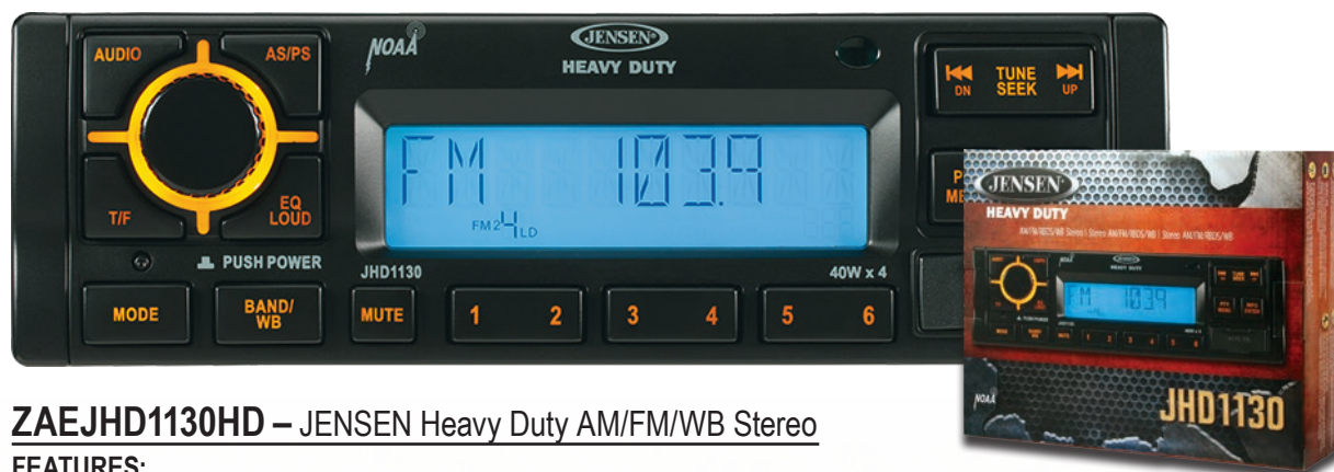
ZAEJHD1130HD – JENSEN Heavy Duty AM/FM/WB Stereo FEATURES:

Seven-channel NOAA weatherband tuner with "Weather Alert" feature, which audibly alerts users and automatically switches the stereo to the appropriate NOAA weather channel when inclement weather is on the horizon.