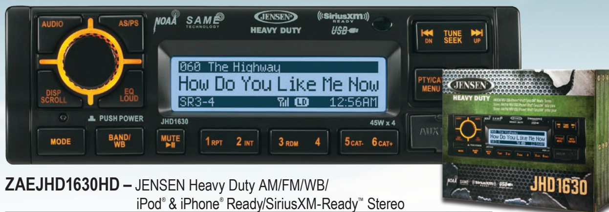
ZAEJHD1630HD – JENSEN Heavy Duty AM/FM/WB/ iPod® & iPhone® Ready/SiriusXM-Ready™ Stereo Same features as ZAEJHD1635BTHD with the exception of Bluetooth and rear USB input.