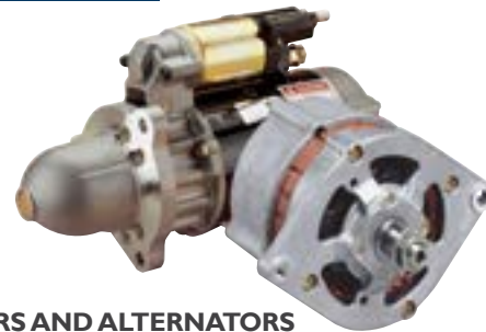
STARTERS AND ALTERNATORS