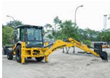
A RELIABLE BACKHOE