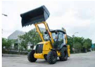
AN EFFECTIVE LOADER