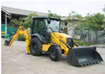
COMFORT AND SAFETY