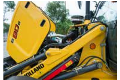
EASY MAINTENANCE ACCESS