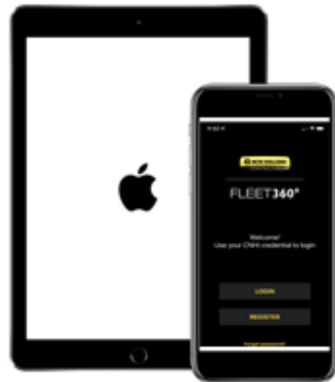
Min OS Version: 11.0