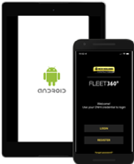
Min OS Version: 5.1